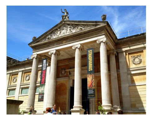
Figure 1: Ashmolean Museum Oxford http://heathrow-airport-our-guide.com/ attractions/oxford-and-the-ashmolean/