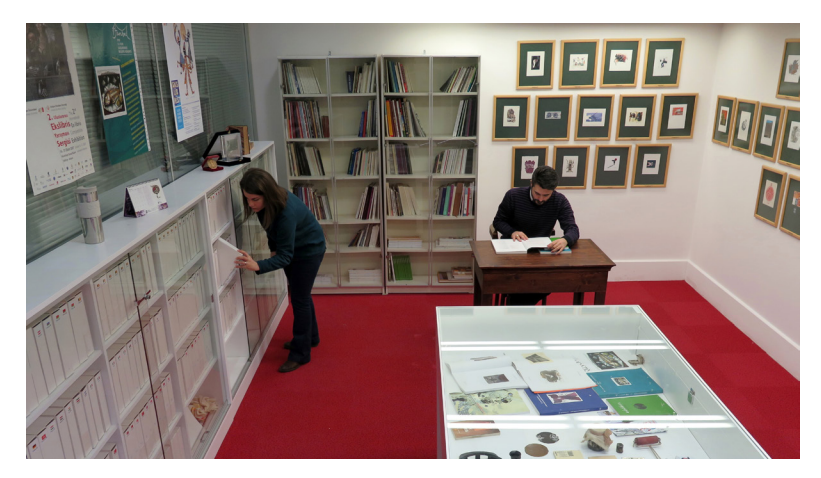
Figure 3: Inside of the Istanbul Ex-libris Museum

"Thanks to young people visiting museums often, most of the time with their families and friends, their personal taste and aesthetic point of view may be improved so as to enhance their habit of visiting museums. These visits translate to the adoption of the idea that education and training do not stop after the closure of schools, which is then this training becomes "Lifelong Education". (Pekgözlü Karakuş, 2012, 134)