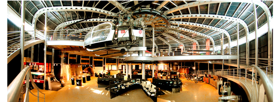
Figure 2: The Middle East University Science and Technology Museum https://tbm.metu.edu.tr/bilim-ve-teknoloji-tarihi-sergisi

Organizing training activities for all ages and groups in the society is among the missions of university museums. In this way, universities also gain the opportunity to spread the knowledge they produce to the community. Although economic developments have negative effects on museology, ensuring their continued presence must be a task we embrace. (Stanbury, 2000)