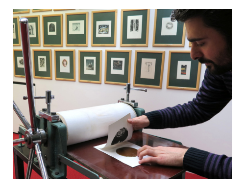
Figure 8: A workshop in the Istanbul Ex-libris Museum