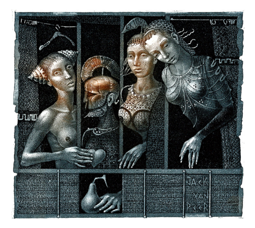
Figure 5: An ex-libris of Eduard Penkov (Bulgaria), C3+C5, 110X95 mm, 2006