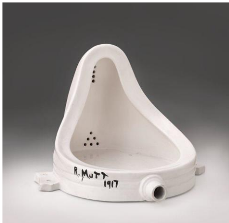
Figure 7. Duchamp, Fountain , 1917

Ordinary products and ready-mades, such as Duchamp's Fountain (Figure 7) and Warhol's Brillo Boxes (Figure 8), started to appear as artworks in the postmodern era as well. All these attempts and artistic expressions started to tear down the notion and logic of sculpture completely. Therefore, as a result of this transformation and the elimination of the border between art and daily life in the expanded field of postmodernism, the pedestal has disappeared within the sculpture once again and dissolved into immateriality, on a more conceptual level (Krauss, 1979; İlden & Mutlu, 2020).