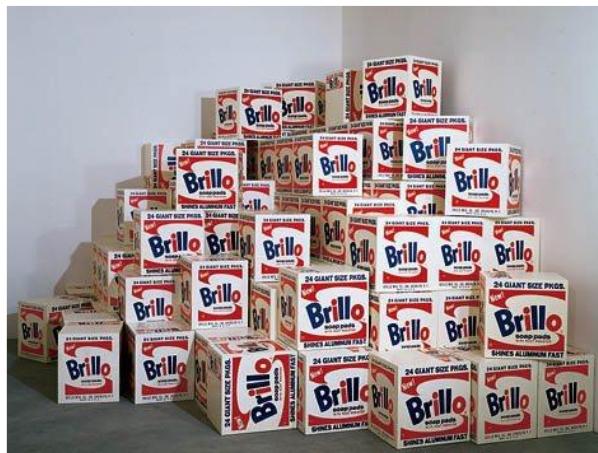
Figure 8. Warhol, Brillo Boxes , 1964

With the technological developments in the late 20 th century, installations and land art emerged as a new form of artwork, bringing about the temporality, sitelessness, and impermanency of the artwork, which was beginning to go through representational and expressional transformation, such as reproducibility, transportability, and using different materials and mediums (Krauss, 1979). Audiovisual mediums have become an integral part of installations. Video and especially photography have become a medium for capturing the impermanent or very large-scale land art or performance art, i.e. the experience. Due to the technological and scientific advancements in the 21 st century, the ever-increasing emphasis that has been put on experience and participation in artworks has been even stronger on the participant's emotions and senses, which have started to become the artwork itself. Therefore, the sensory experience of the participant has been put on a pedestal, on a conceptual level.