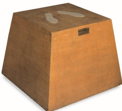
Figure 5. Manzoni, Magic Base-Living Sculpture , 1961