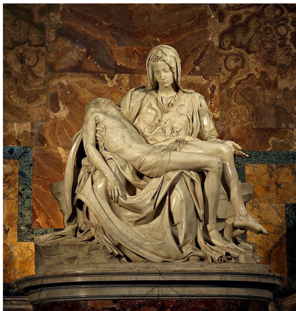
Figure 1. Michelangelo, Pietà , 1498-1499

increase the stupendous look of the sculpture and support it visually and physically. Therefore, pedestals had many ornamental and figurative details and were giant in size in order to enhance the sculpture's meaning. Another function of the pedestal was to secure the site of the sculpture, support it to stand, and lie down as its base in order to connect it to the ground.