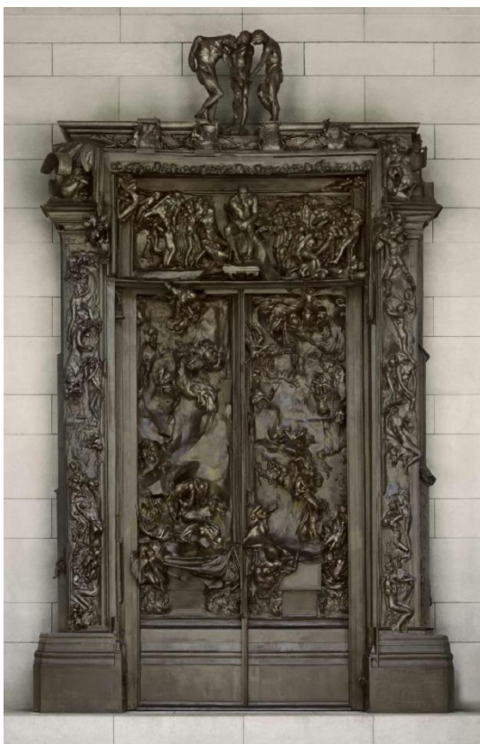
Figure 2. Rodin, The Gates of Hell , 1880-1885

With the beginning of modernism in the late 19 th century, the relationship between the sculpture and the pedestal, i.e. the existence of the pedestal as the implication of the sculpture's bond to a specific site, has started to be questioned. Rodin's works, The Gates of Hell (Figure 2) and Monument of Balzac (Figure 3), were the first examples of this transition that the sculpture went through, declaring the nomadic meaning and function of the artwork (Krauss, 1979). The sculpture liberated itself from the strict rules of creating the ideal beauty of the previous period and the pedestal became a part of the sculpture by leaving its function as a base behind and instead dissolving into it. Therefore, its transition signaled the changes in its function and meaning, becoming much closer to those of the sculpture.