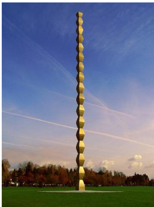
Figure 4. Brancusi, Endless Column , 1938

In the early 1990s, Brancusi's revolutionary use of pedestals influenced and inspired his contemporaries in terms of bestowing great importance to the pedestal as a part of the art and that is absorbed by the artwork (Constantin Brancusi, 2016). For instance, the Endless Column (Figure 4), consisting of repetitive forms that appear as if it drills the ground to reach the sky without limit and ascend to infinity, is a pure pedestal itself (Krauss, 1979). The liberation of the pedestal by being absorbed into the sculpture has brought about the independence of its existence from its connection to the ground. Thus, the pedestal-sculpture relationship shattered; instead, they both united and, at the same time, freed from each other due to this notion of belonging.