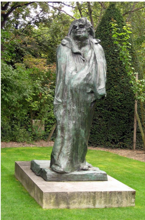
Figure 3. Rodin, Monument of Balzac , 1891