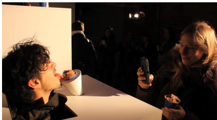
Figure 11. The pedestal-artwork relationship in Lickestra (Mold, 2013)

The participant, i.e. the eater/licker, of Lickestra is the performer licking the ice cream in an interactive cone and his or her sensory perception oscillates between different senses. In this work, the unique sensory experience basically appears as the artwork and the body as the pedestal within a pedestal. While participants create the art themselves, the audiovisual experience for the non-lickers, i.e. only viewers and listeners, is another artwork presented simply on a pedestal lifting up the experience-creators (Figure 11). In parallel with the postmodern and contemporary understanding of the art, anyone can become an artist and any “sense” and “experience” can become an artwork – impermanent, temporal, siteless, and merely taken out of the daily rituals.