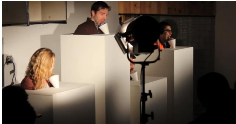
Figure 10. The Lickestra experience (Mold, 2013)