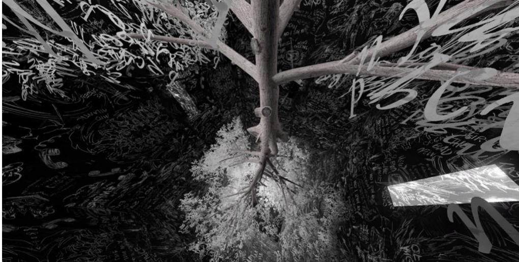
Figure 1. Chalkroom by Laurie Anderson and Hsin-Chien Huang, The Tree Room, 2017.

The virtual environment decorated with images, symbols, and handwriting creates an uneasy sense of curiosity and gives a feeling of being lost in the dark labyrinths of the mind. In the Cloud Room, the user can interact with the nebula vortex of words. The user can perform sculpting with his/her own voice in the Sound Room and can fly around the tree made of letters in the Tree Room. As the user navigates through mazes of huge chalkboards, they get involved in the story by experiencing different forms of interaction in each room. The fragmented words may create new meanings by reconstructing of them with user interaction.