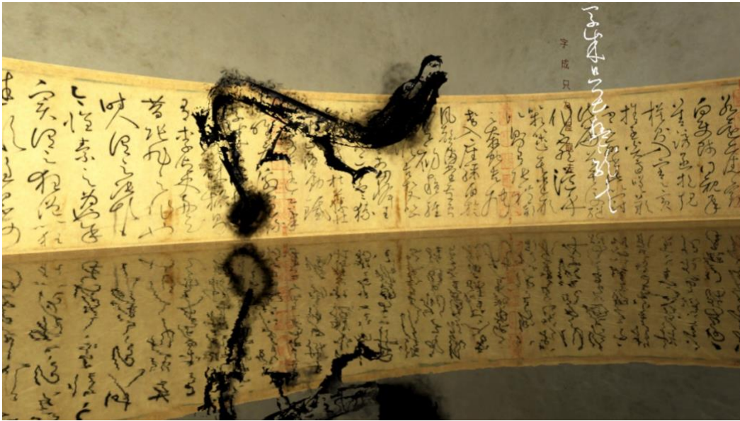
Figure 6. Spirit of Autobiography by Taiwan's NPM and HTC VIVE, 2017.

Autobiography consists of poetic tributes to his calligraphy works by his contemporaries. While Calligraphy also has a philosophical aspect. It is an ancient art of discipline, mind and spirituality. In this sense, VR is the most effective medium to make a person feel the philosophical depth of calligraphy and reflect its conceptual infrastructure with immersive narratives. The Spirit of Autobiography VR installation effectively reflects the smooth and rhythmic nature of the text, with Huaisu's wild and crazy brushwork.