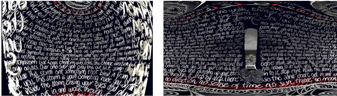
Figure 4. Code of Silence by author, 2020.