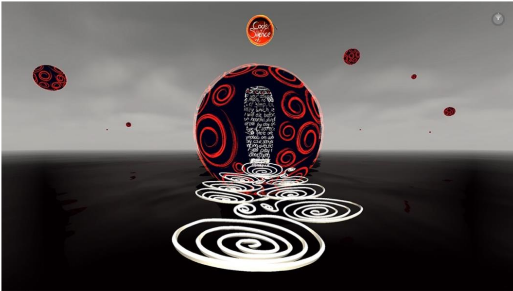
Figure 3. Code of Silence by author, 2020.

The texts inside this sphere are quoted from Haruki Murakami's novel Kafka on the Shore (2002). The inner wall of this sphere is completely covered with handwritten texts. The texts are written with the 3D Brushes of the Tilt Brush App. There is also a lettering design inside the upper hemisphere of the big sphere. For the lettering, a 3D composition was created by carefully drawing each letter. Although writing in the space is a different action from usual habits, Tilt Brush App offers a comfortable and smooth writing experience. For this project, before I started working inside VR, I developed my ideas and concepts by drawing 2D sketches. Then I started drawing in VR in light of the final draft. But while working on my task, the endless freedom of drawing in a VR environment led me to modify my idea in reference draft. Although the main concept of Code of Silence and the intellectual aspect of it did not change, I personally experienced the potential of VR to change perception and interpretation in the creation processes (Figure 4).